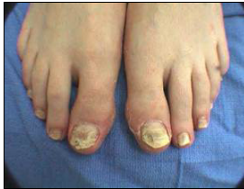
Examples of difficult to treat fungal infection