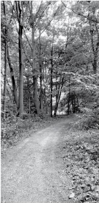
Your guide to some of Stratford's favorite walking routes